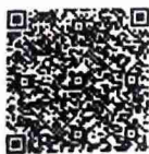
Registrar Pharmacy Council